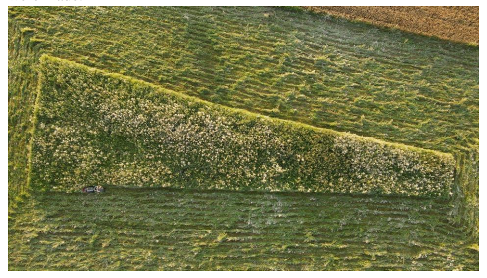
During 2 week of our stay we were mostly engaged in the hemp-related activities-making hempcrete and hemp paper. Learning how to make hemp oil. Helping the host to pack orders and making videos and pictures. We also took part in a local fair selling hemp-made products to locals, learning the skill of selling and buying and presenting the products. We also took part in the hemp museum tours, meeting the arriving guests. Artem assisted in making videos and photos.

the hemp shop. We were shown the hemp fields, saw the hemp products and learned how they were made.