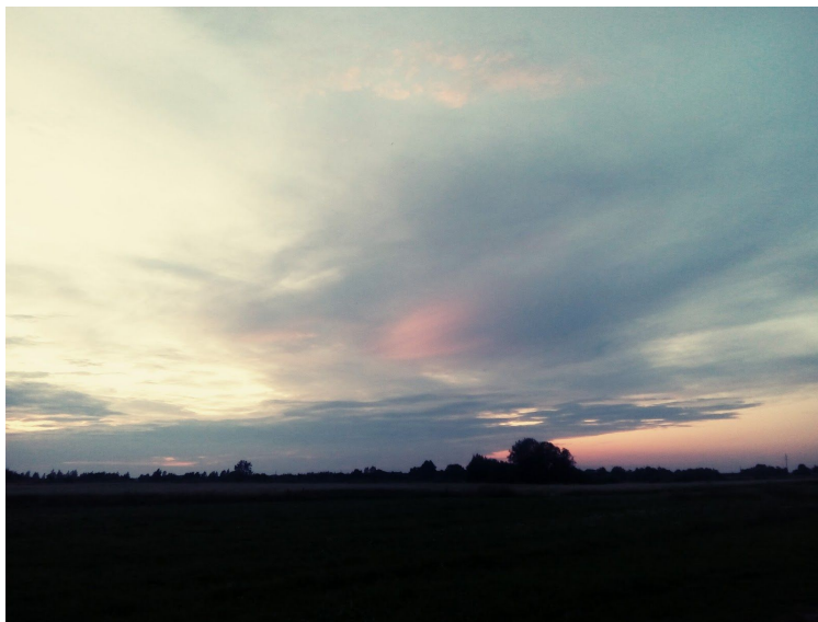
The amazing Latvian sky. All the days, I was able to enjoy this natural spectacle.