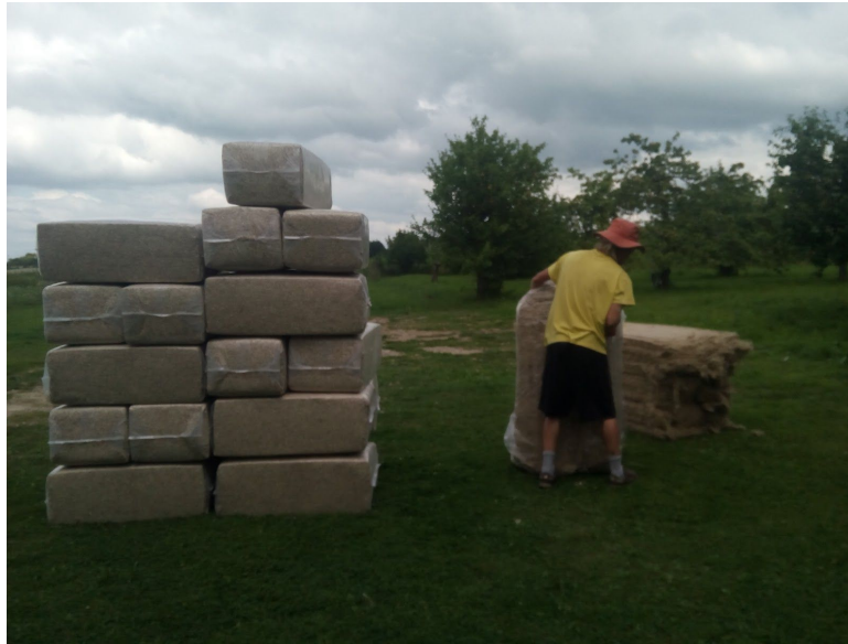
Andris preparing the material for Hemp building course 2019