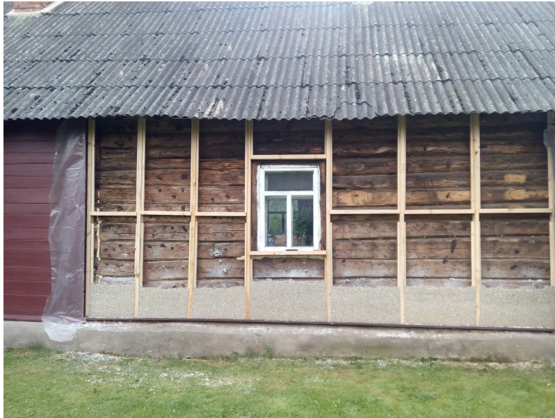
Wall preparation for the Hemp Building Course 2019