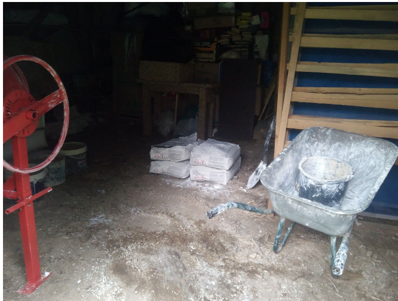
Preparation for the Hemp Building Course 2019