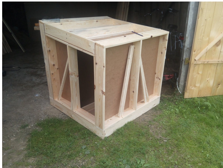
This year in The Hemp Building Course there was the mission to donate 3 dog houses for Municipal Kneel.