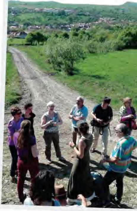
1a. 1b. 1c. European Herb Gathering 2018 in Lupeni, Transylvania

The tight-knit, self-sufficient communities in rural areas became a problem for Nicolae Ceausescu, general secretary of the Romanian Communist Party. In 1970, under the 'systematisation of the territory' programme he forced an aggressive industrialisation of the countryside, including some parts of Transylvania. That resulted in the destruction of villages, the demolition of houses and the uprooting of people. Families were moved into towns and put into small flats. Local oral histories tell us that elderly people began taking their own lives, in their own homes, fearful of the forced evictions.