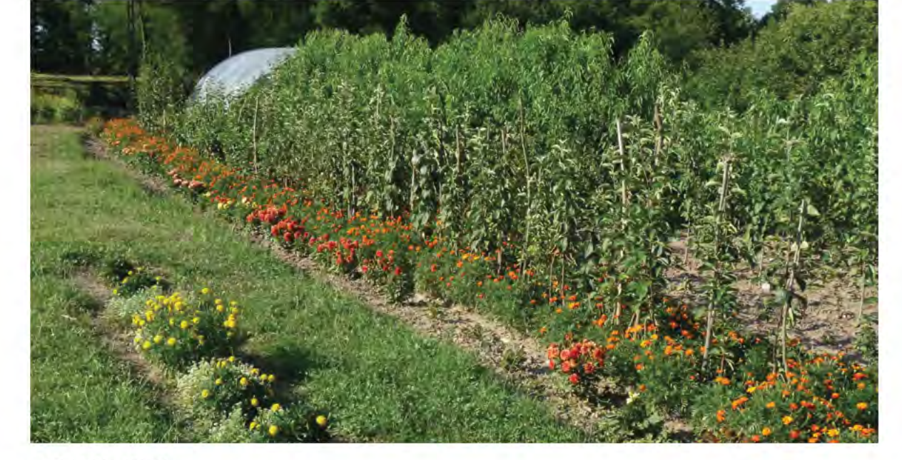
2. Orchard with traditional fruit varieties and vegetables