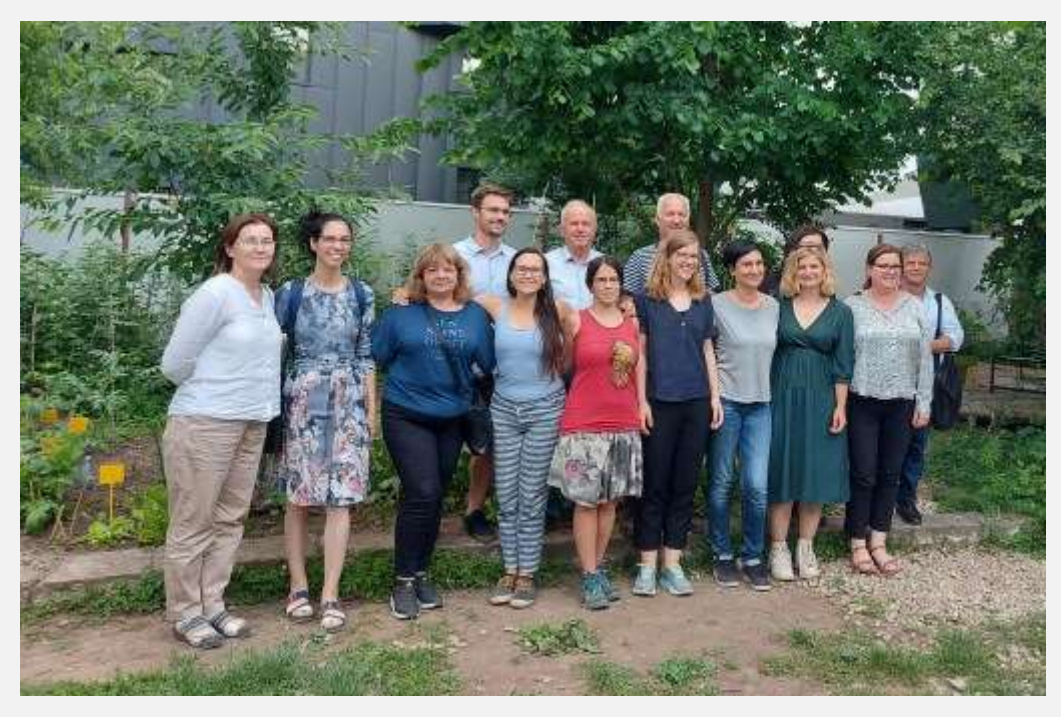
Bucharest, May 2022

Balkan Seed Network is a network consisted of seed savers, breeders, scientists, farmers, gardeners, associations, organizations, research institutes and educational institutions active in the Balkans.