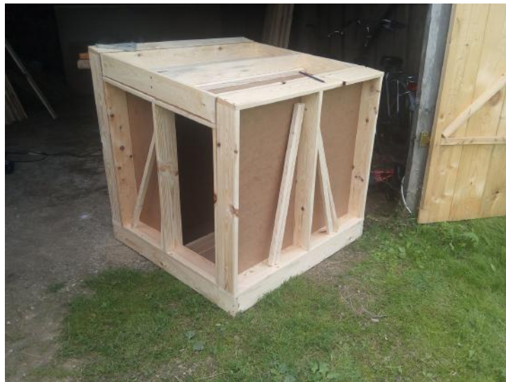
This year in The Hemp Building Course there was the mission to donate 3 dog houses for Municipal Kneel.