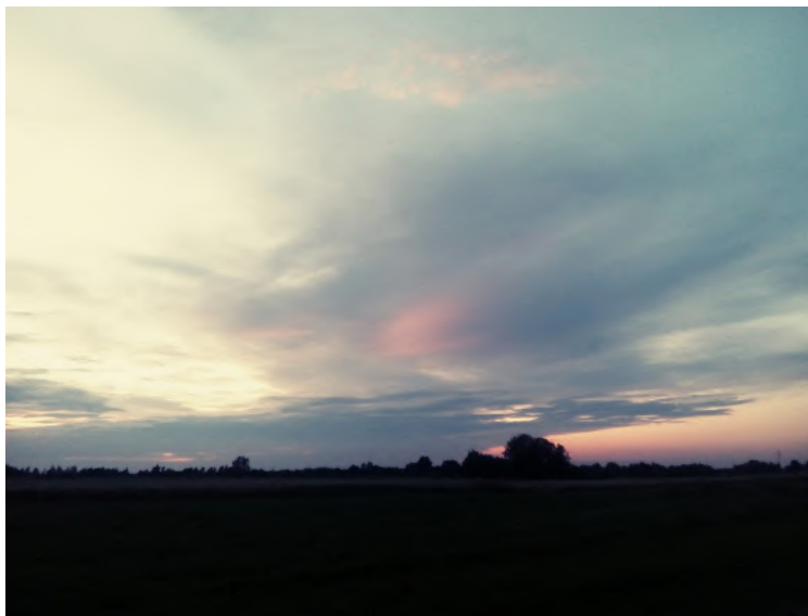
The amazing Latvian sky. All the days, I was able to enjoy this natural spectacle.