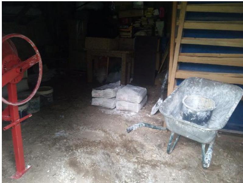
Preparation for the Hemp Building Course 2019