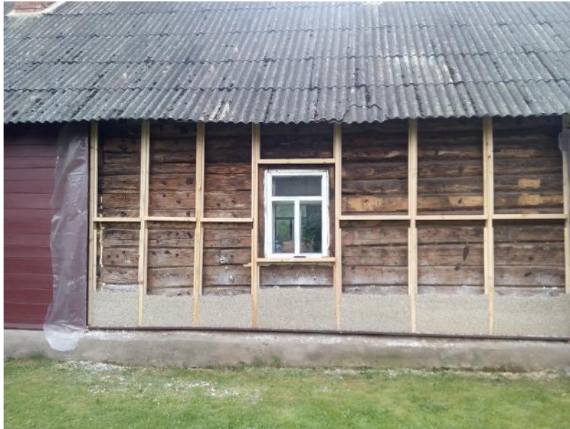
Wall preparation for the Hemp Building Course 2019