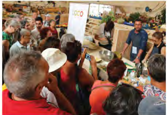
10. Diet Route Stand on revolution day's festivity in Lisbon 11. Tavira Mediterranean Diet Fair