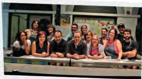
12. Christmas festivities with local community 13. Team involved in Tavira Med Diet Fair