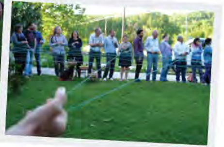
7a. 7b. Feeling connected across Europe