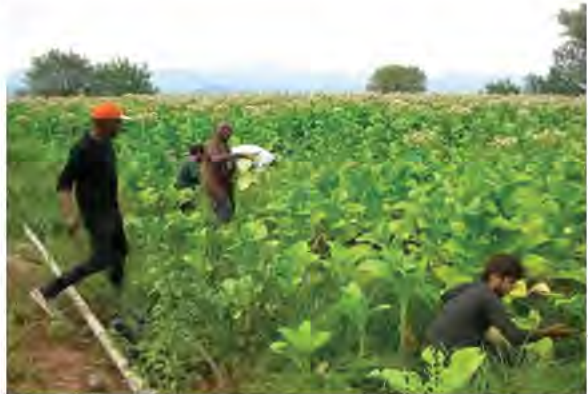
14. Pilot initiative for the employment of asylum seekers and refugees in Karditsa