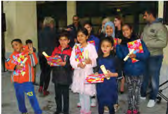
13. At school for the first time. Learning Greek and Arabic