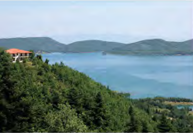
3. View of lake Plastiras