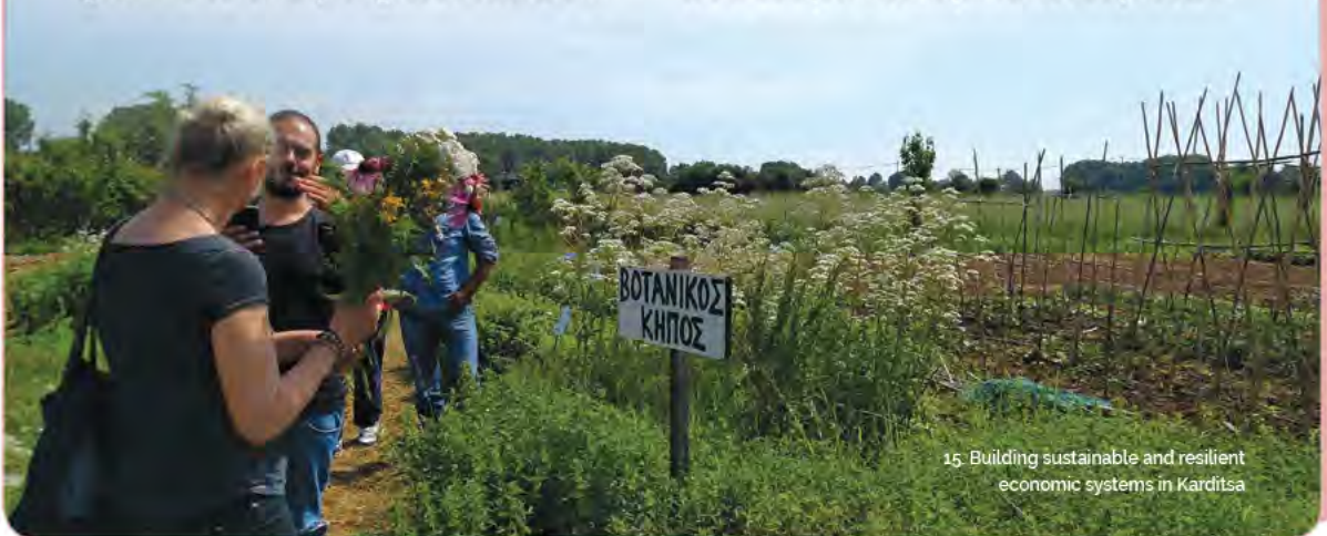
15. Building sustainable and resilient economic systems in Karditsa

The ecosystem of collaboration is one such approach. And if you ask me, hope is still here! It lies in all those small, agroecological pockets of resistance and sustainability springing up like mushrooms everywhere. Perhaps it is no coincidence that 'Karditsa' means 'little heart'. Perhaps she (for the heart is feminine in Greek) is the beating heart of a future that brings true rural sustainability for a country which so badly needs it.